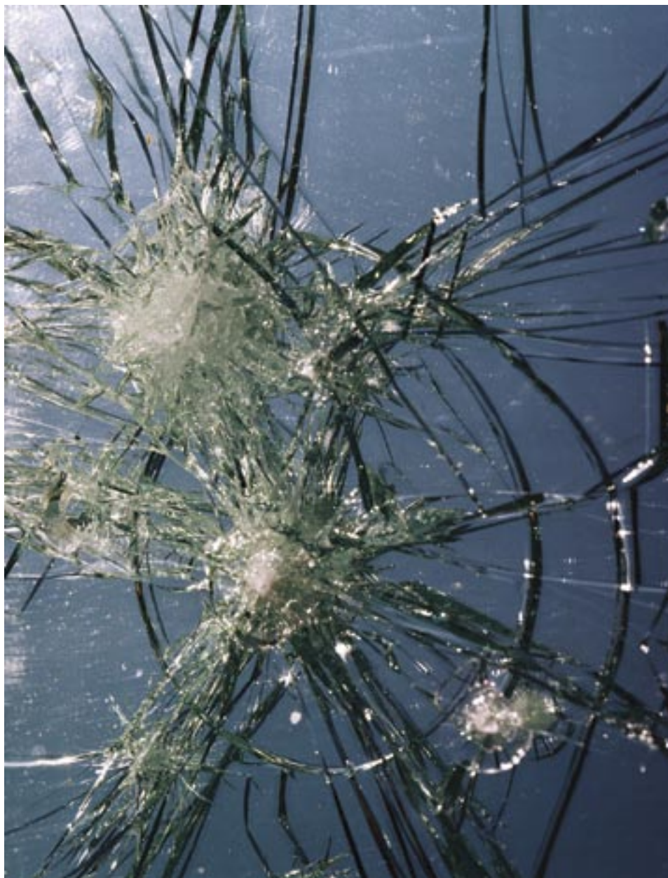
Untitled 4 , 2005 c-print 60 x 48 inches, edition of 5