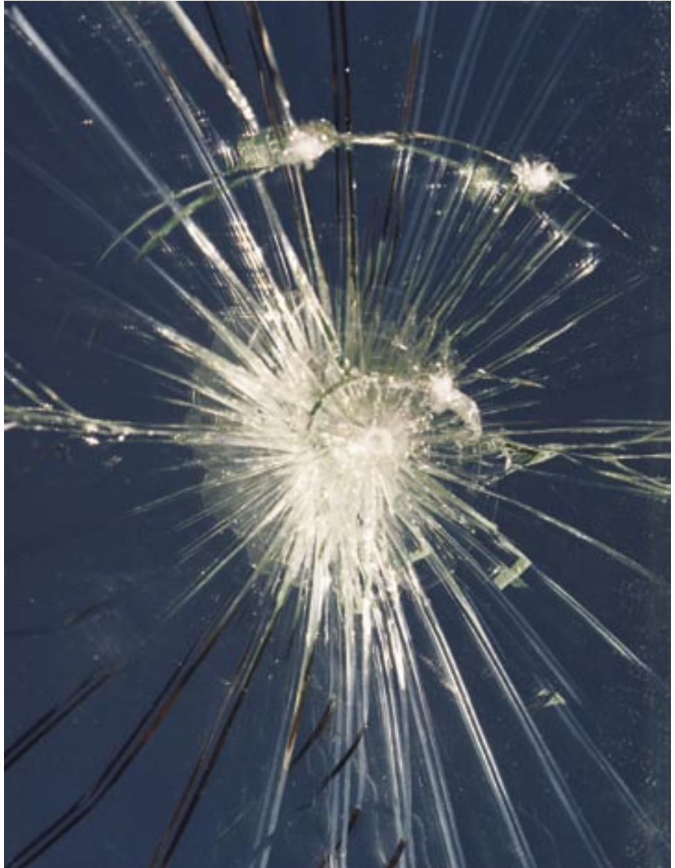
Untitled 3, 2005 c-print 60 x 48 inches, edition of 5