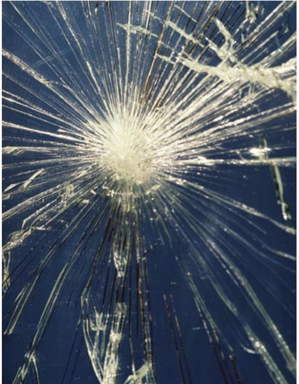
Untitled 1 , 2005 c-print 60 x 48 inches, edition of 5